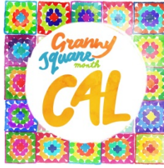
Square 14 - @costume.by.helena